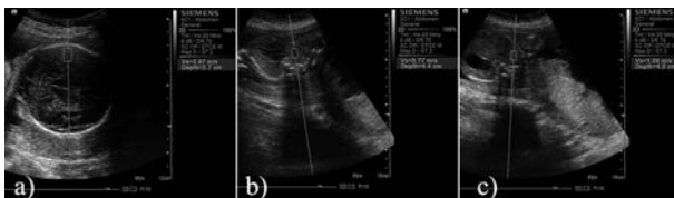
Fig 1. Shear wave velocity measurement at the cerebral parenchyma (a), right lung (b) and right lobe of the liver (c) with virtual touch tissue quantification.