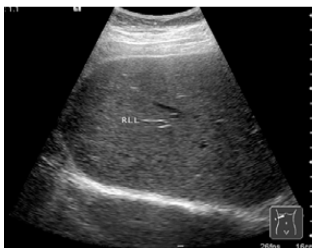
Fig 3. Right subcostal section in the right liver lobe with the visualization of diaphragm posterior.