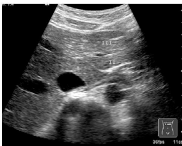
Fig 2. Right subcostal section with the visualization of the bifurcation of the portal vein, inferior vena cava in posterior and left and right liver lobes.