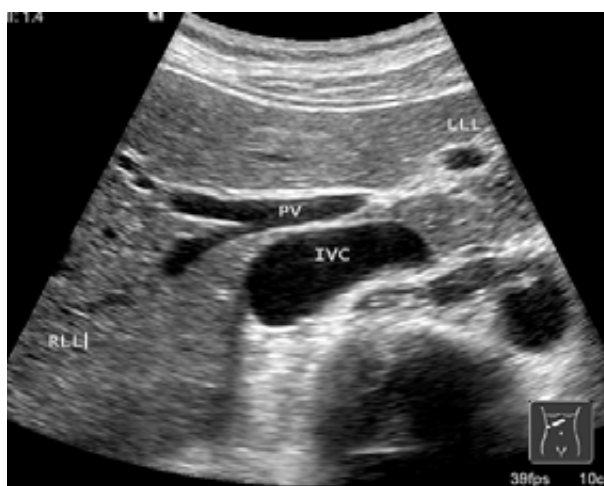
Fig 4. Right subcostal section in the right liver lobe with the visualization of a branch of the suprahepatic veins and the inferior vena cava.