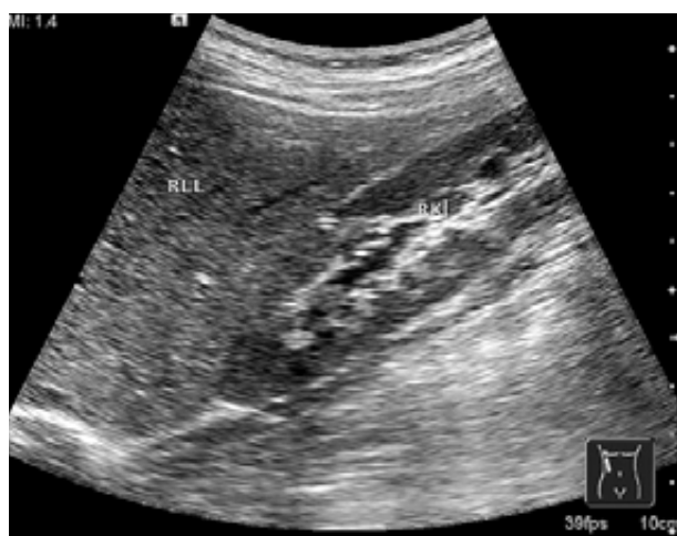
Fig 1. Left liver lobe, transversal section with the caudate lobe near the inferior vena cava and the segments II and III.

The oblique subcostal sections starting from the epigastrium examine the left liver lobe from the inferior and up to the superior side of it in order to cover the entire structure of the left liver lobe (fig 2). By moving the transducer towards the right hypocondrium we can examine the right liver lobe (fig 3). In this oblique subcostal section we can also see the portal bifurcation with its right and left branches (fig 4), while in a superior plan we can find the suprahepatic veins together with the inferior vena cava (fig 5, 6, 7).