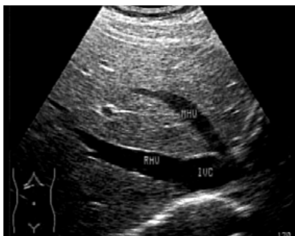
Fig 7. Sagittal section in the right upper quadrant with the visualization of the right liver lobe and the right kidney.