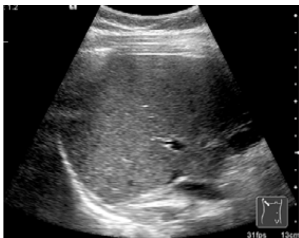
Fig 9. Intercoastal section through the right liver lobe.

In a sagittal section starting also from the epigastrium, we can locate the left liver lobe as well as the caudate lobe standing in front of the inferior vena cava (fig 8). It is recommended to measure the antero-posterior diameter of the caudate lobe as it can be enlarged in case of liver cirrhosis (usually more than 35 mm). By moving towards the right flank we will scan the entire liver in a sagittal section encountering also the gallbladder.