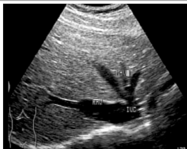
Fig 6. Right subcostal section in the right liver lobe with the visualization of the suprahepatic veins.