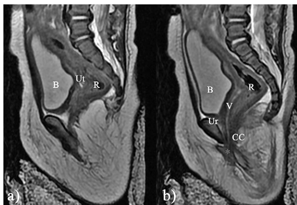
Fig 3. Sagittal MRI of the lower abdomen showed the rectum (R), vagina (V), uterus (Ut), bladder (B), urethra (Ur), and ill-defined common channel (CC).

and preoperative visualization of PC. In addition, CEUS lacks ionizing radiation and can be performed without general anesthesia or sedation.